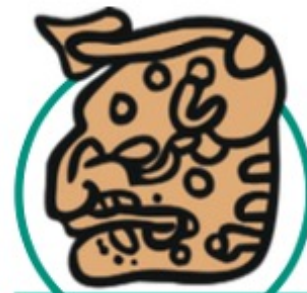
The Maya logogram for b'alam – jaguar

The Maya writing system, used to write several different Maya languages, was made up of over 800 symbols called glyphs. Some glyphs were logograms, representing a whole word, and some were syllabograms, representing units of sound. They were carved onto stone buildings and monuments and painted onto pottery. Maya scribes also wrote books, called codices , made from the bark of fig trees. Only priests and noblemen would know the whole written language.